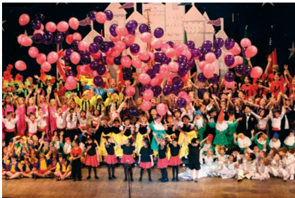
Music Fundamentals and Creative Keyboard students in a fun performance at the Palace Theatre