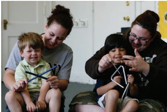
Making music is more fun with a partner