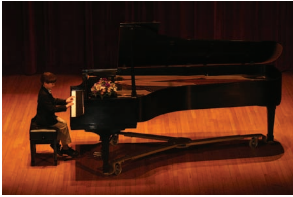
A young pianist in recital at the SUNYA Performing Arts Center